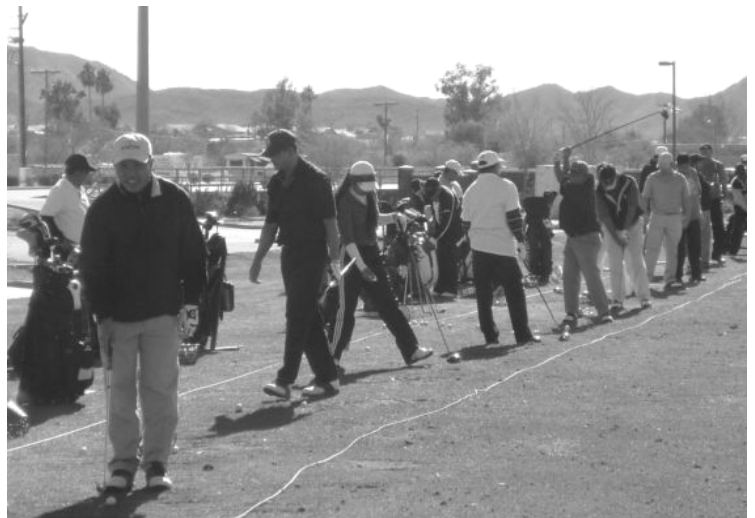
Above: Fil-Am and PGC Golfers warming up at the driving range before tee off!